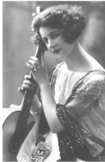
Flappers 31 The Stampsmith copyright 2008 www.stampsmith.net